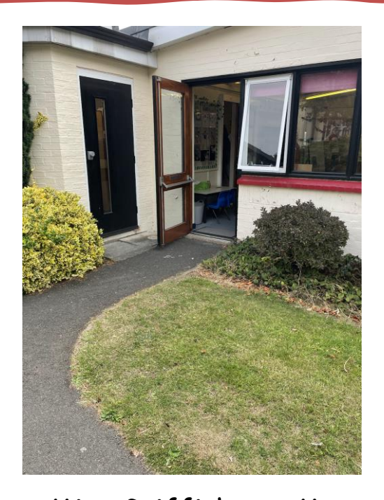
Miss Griffiths or Mr Merrall will lead you out of the side door and will hand you over to your grown up.