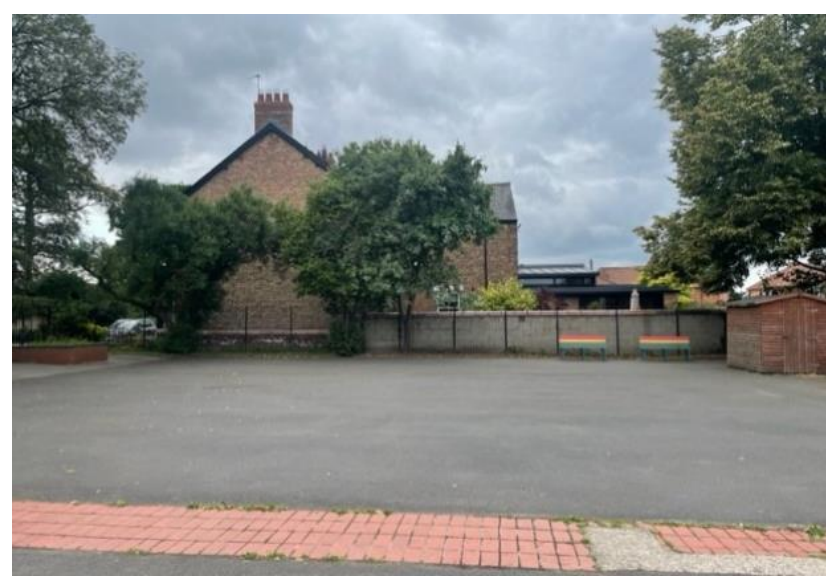
Mrs Atkinson and Mrs Reeves will lead Class 4 and Class 5 out via the quiet area and will hand you over to your grown up.